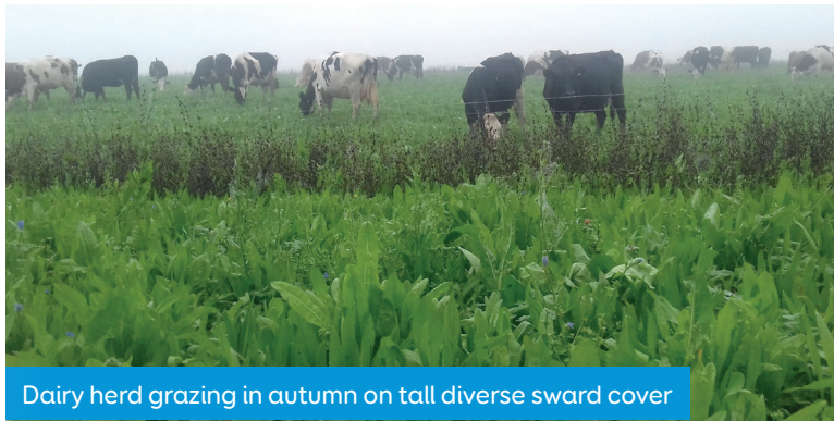
Dairy herd grazing in autumn on tall diverse sward cover

Some early UK research into the regenerative strategy of diverse swards with minimal N use have shown competitive productive output in terms of tDM/ha and comparable ME so large reductions in stocking rate may not be needed long term. (Google Field Options sward diversity or contact Germinal for an update on their trials).