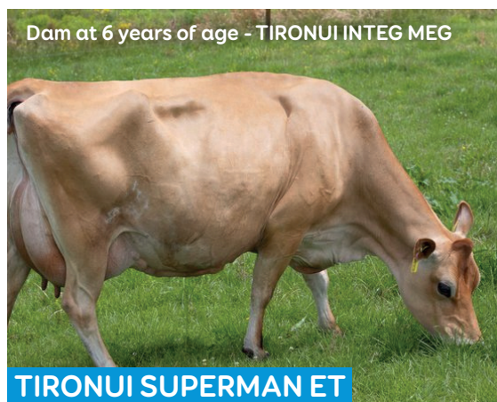
Dam at 6 years of age - TIRONUI INTEG MEG

Well, like all good things worth waiting for it takes time... and timing is everything.