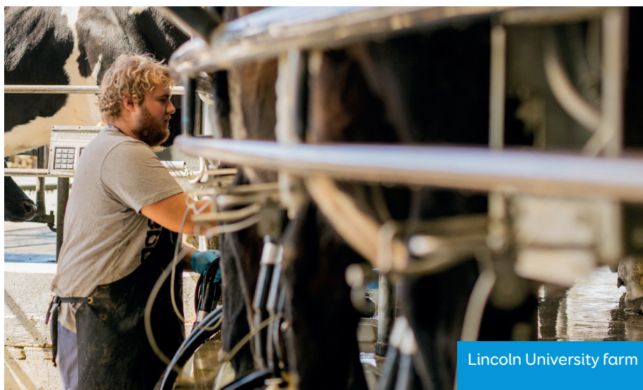
Lincoln University farm

He says the benefits of whole herd testing go well beyond easy identification of calves to dams during winter calving (potentially eliminating the labour-intensive job of manually matching and recording animals in the paddock).