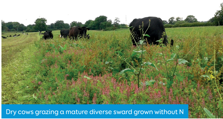
Dry cows grazing a mature diverse sward grown without N

impacts. (Google Green Cover Seed Dr Christine Jones The Nitrogen Solution) The fact that soluble fertilisers end up in our waterways and atmosphere (without including the carbon footprint of its manufacture and transport) probably means our reliance on this practise should be at the very top of our list if we are to reach carbon neutral status. For most, this will be the hardest hurdle to jump as we grapple with the implications of such a change. Instinctively we assume this means less output. Depending on your farm system maybe it does. However, does it have to mean less profit?